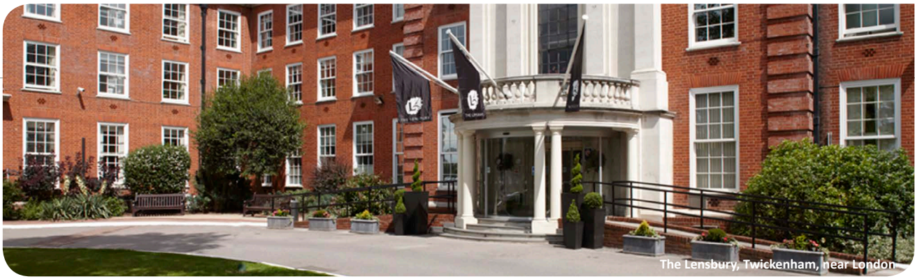
The Lensbury, Twickenham, near London